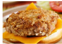
Red Kidney beans