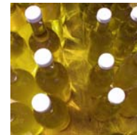
Olive, canola or grape seed oil