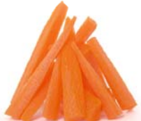
Carrot or carrot juice