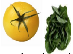
spinach and yellow tomato salad