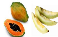
Honeydew melon and papaya slices