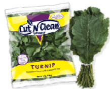
Dark leafy greens