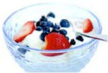
Low-fat or fat free yogurt or cottage cheese

✓ Choose your favorite dairy foods and draw your selection onto the MyPlate activity sheet .