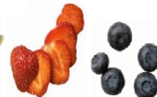
Strawberries & blueberries fruit salad