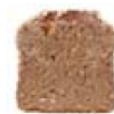
Whole wheat Bread