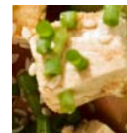
Calcium fortified tofu