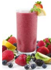
100% fruit smoothie