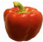
Red bell pepper slices