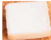
Solid butter or margarine ( instead use butter substitutes made from non-hydrogenated vegetable oils with little or no saturated fat )